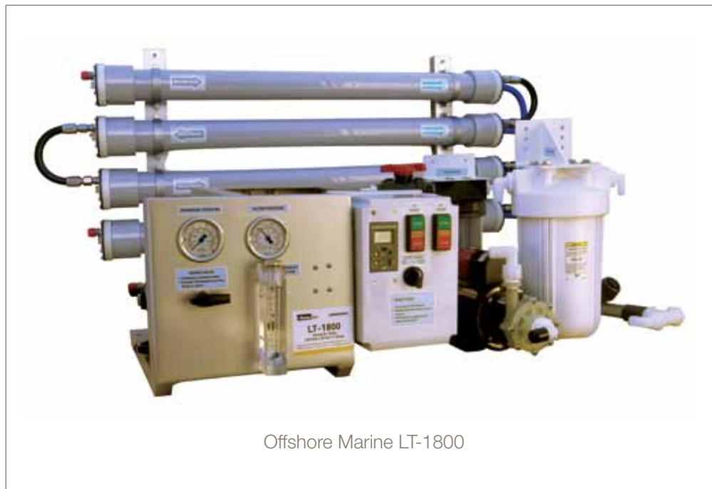
Offshore Marine LT-1800

The units feature a semi modular frame format, for installation flexibility. The frame is compact and can be above or below the water line. The boost pump and prefilters are supplied as loose items.